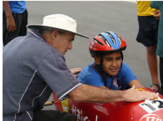
A few hints from a teacher