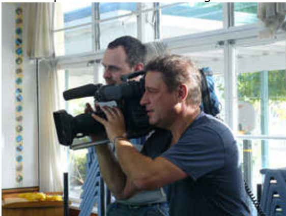
The Director with the cameraman