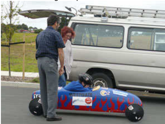
Ready, steady, go!