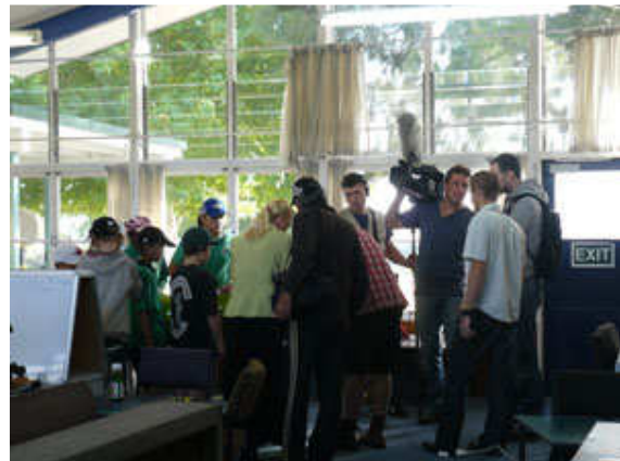
Team and camera crew at work