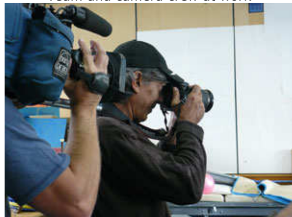
The cameraman videoing the photographer