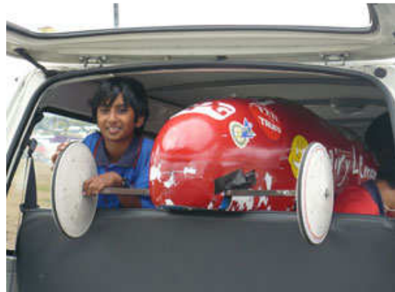
Bringing the car back up the track