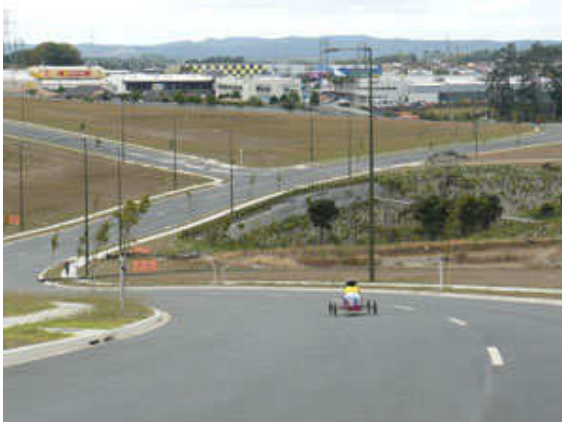
Westgate Drive middle section A great practice site