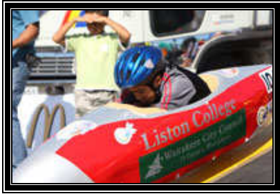
Waitakere City Council