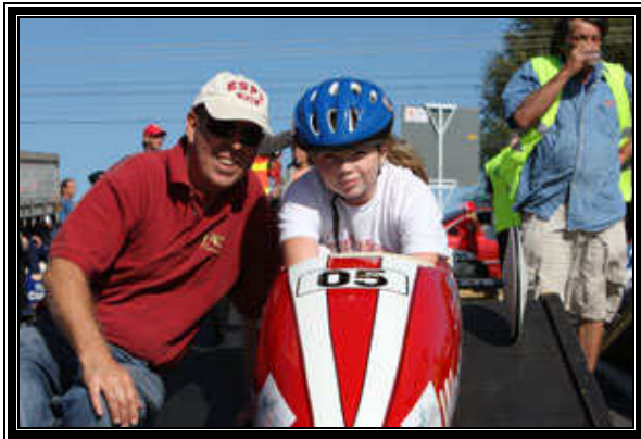
Rangeview parent supporting his team