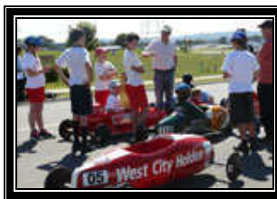
West City Holden