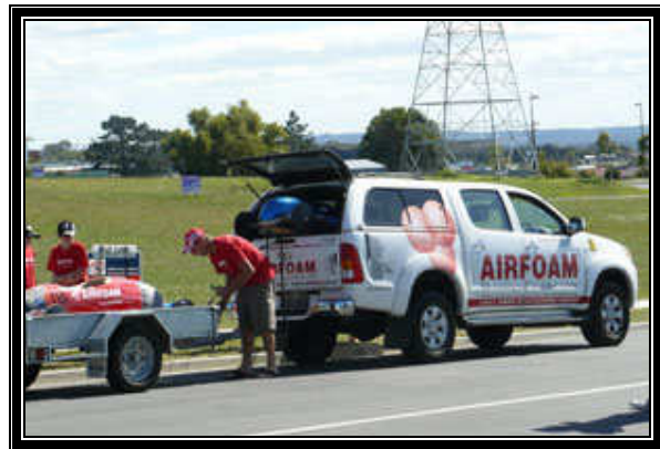
Airfoam Insulation, Taupaki School Sponsor, taking a thoroughly enjoyable, although entirely optional, active part in the practice days and event