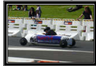
Bearing supplies (NZ); Nachi