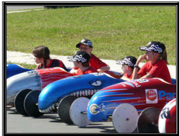
A real learning experience – interviewed for National TV