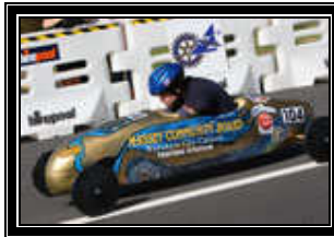
Massey Community Board; Waitakere Vehicle Testing Station