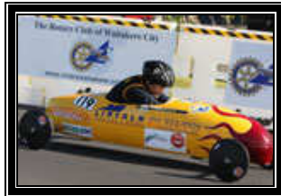
Lincoln Aluminium; Redwood Panel and Paint