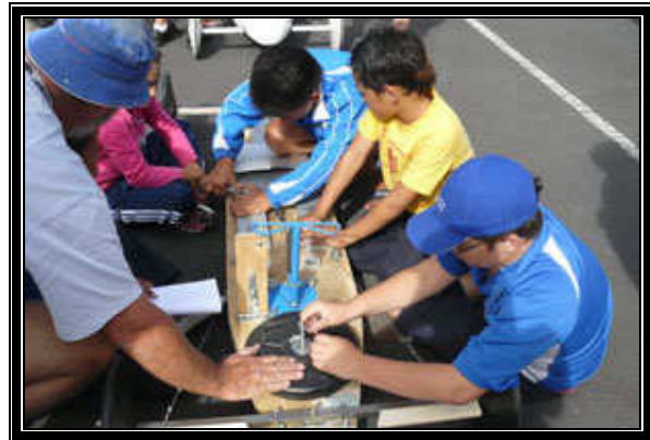
Pomaria School Pit Crew at work under the watchful eyes of a Rotarian