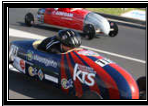
Kumeu Taxation Services