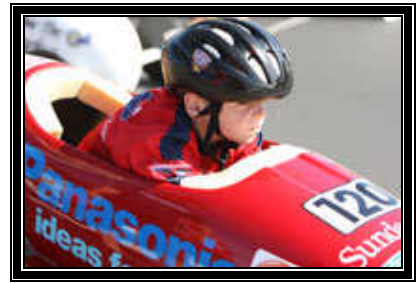
Air Conditioning Services (NZ)