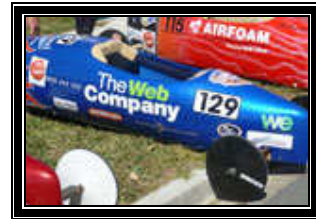
Lewins Electrical Tass Print The Web Company; Waitakere Enterprise;