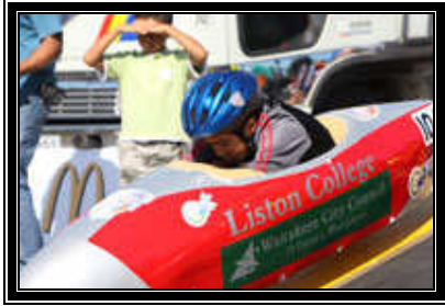
Waitakere City Council