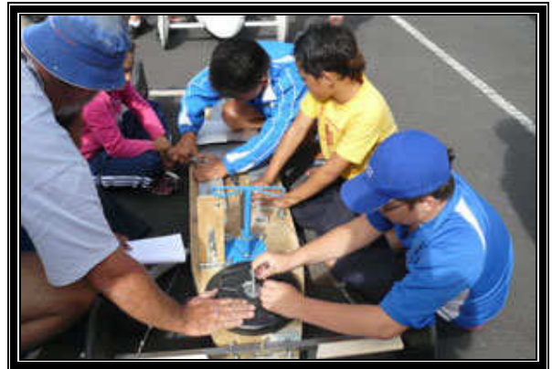
Pomaria School Pit Crew at work under the watchful eyes of a Rotarian