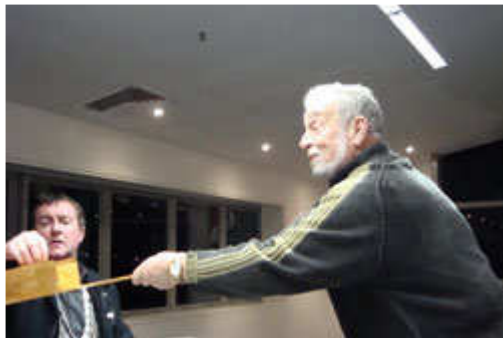
“There goes my bus fare home”