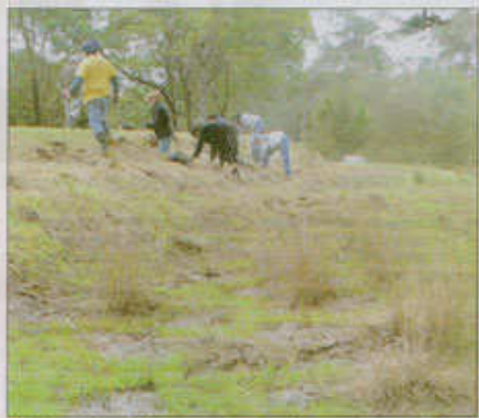
Working hard: Community service workers will know their environmental efforts won't be in vain.

The waterway with its tributaries winds 80km from Waitakere to the Kaipara Harbour.