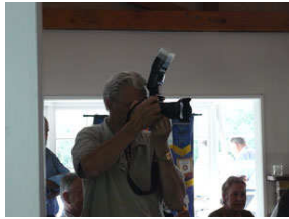
And so was the Henderson photographer