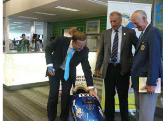
A quick check of the car