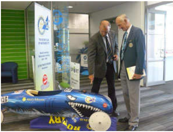
Checking out the car whilst waiting