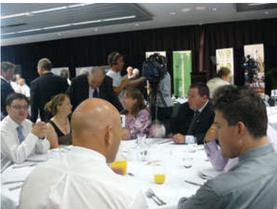
Sunderland table. Rotary banner on stage obscured by a TV camera