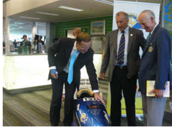
A quick check of the car