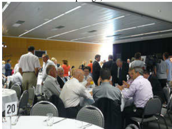
Pre lunch chat