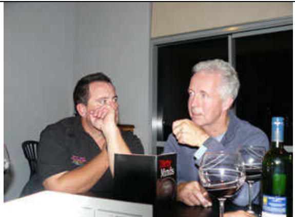
A night of fellowship