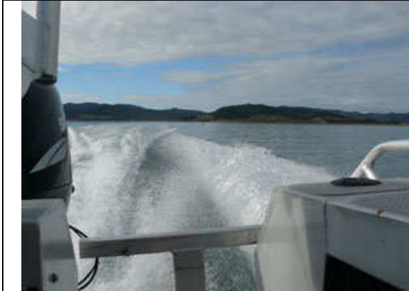
Off to sea...