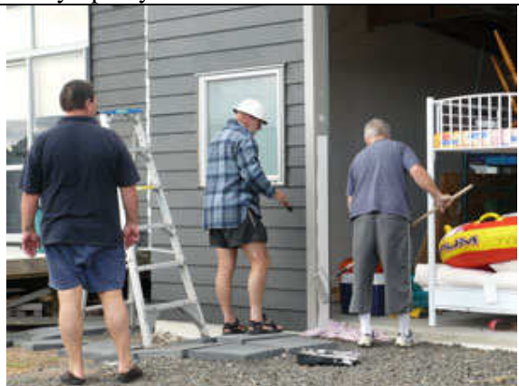
Windows flashed and garage painted (under the eyes of the supervisor)