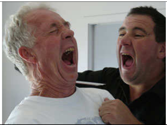
Finish my garage first!