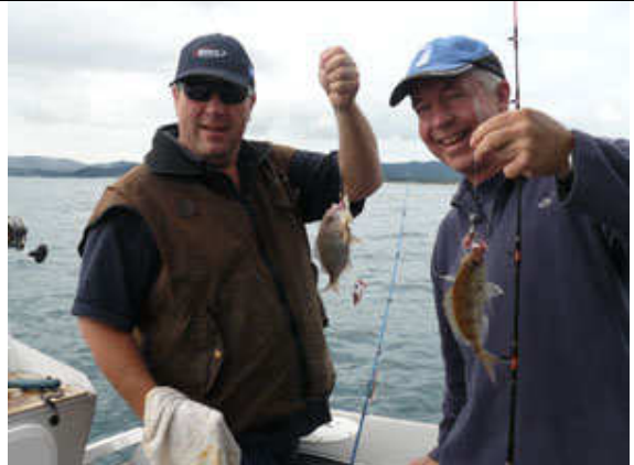
...To catch FISH