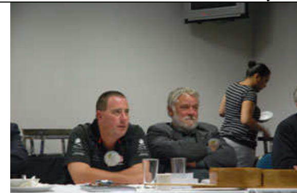
"That talking giraffe is excellent..."