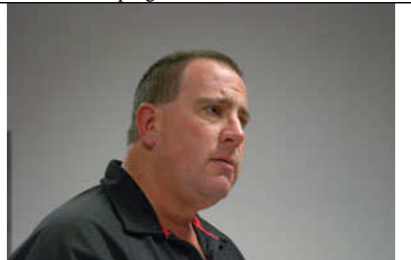
...And he makes so much sense"