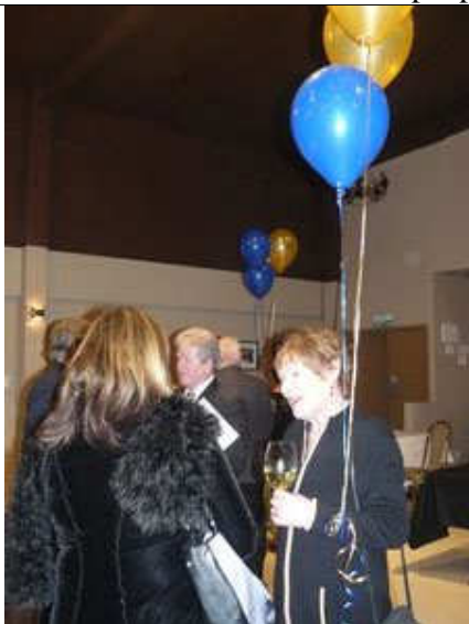
Some people came for the balloons...