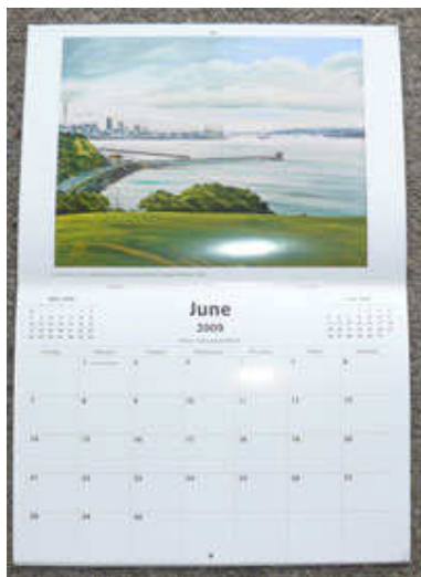
Sample photo from this year's calendar