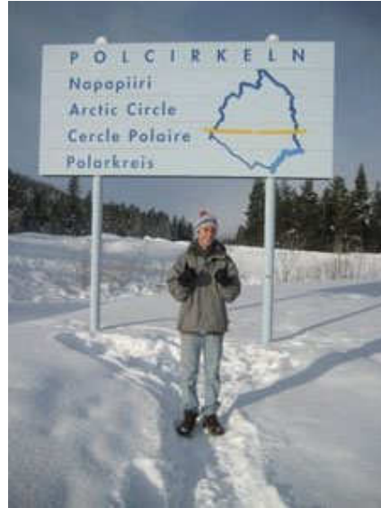
1st time to the Artic Circle.