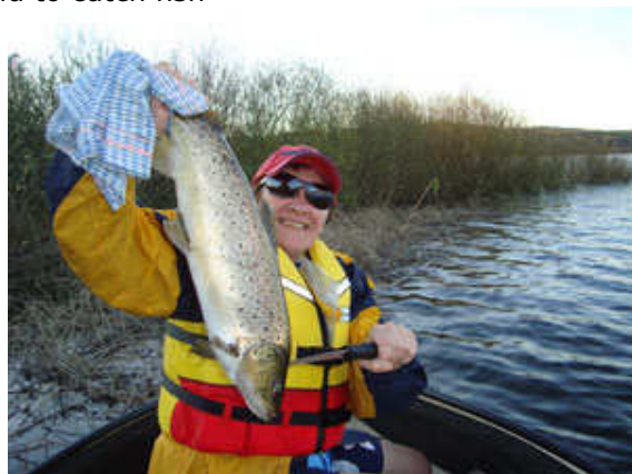
Heather's fish (cooked and eaten)