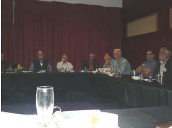
A few of our happy band listening enthralled