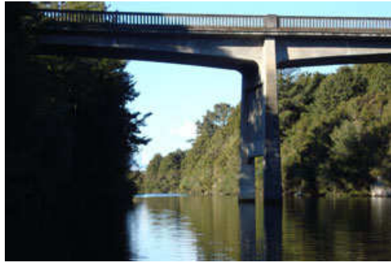
Travelling up the lake into a side river