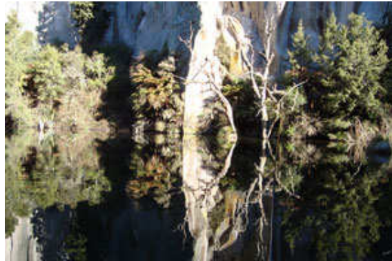
... Into a Lost World to catch fish