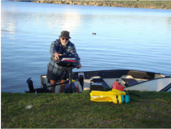
Setting forth in a porta-bote (It folds up to look like a surfboard and unfolds into a 10' dingy)

What Alan and Heather were up to in the last week... In between sorting out Rotary accounts and meals that is: