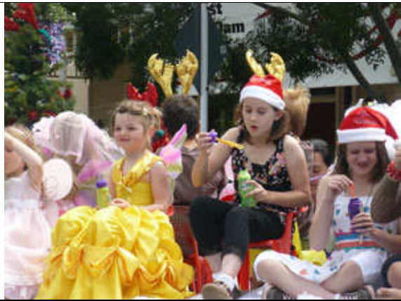
Santa's little helpers