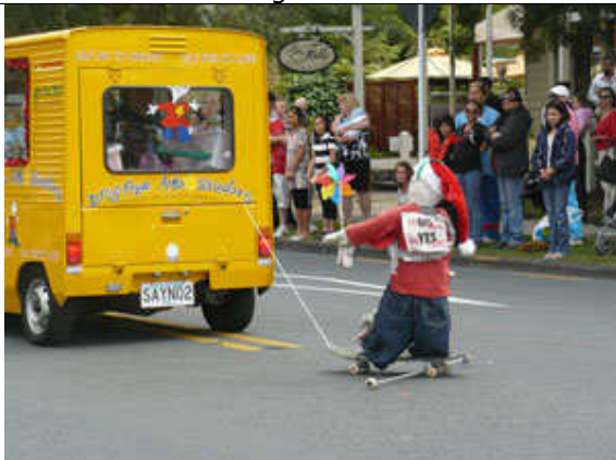
Odd things being towed