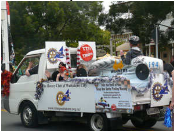
Waitakere City Rotary on the move