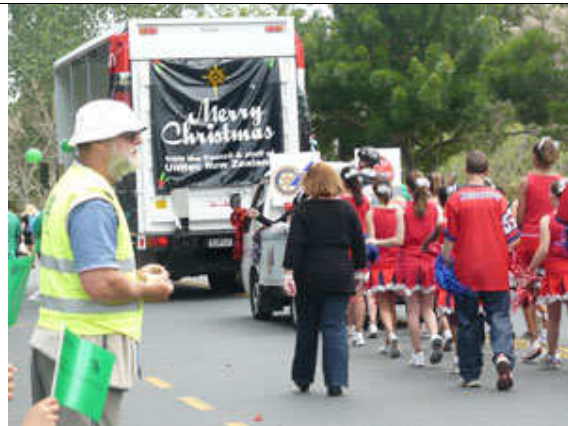
Waitakere City Rotarian on Crowd Control