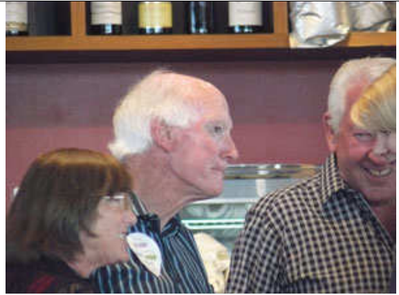
The Birthday Boy in conversation