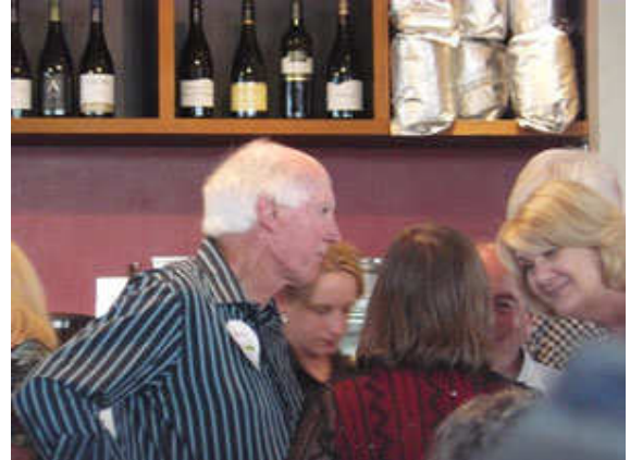
The Birthday Boy with friends and family