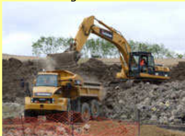
Digger at work