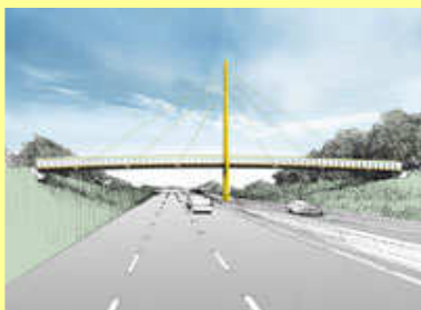
The new bridge... and future road