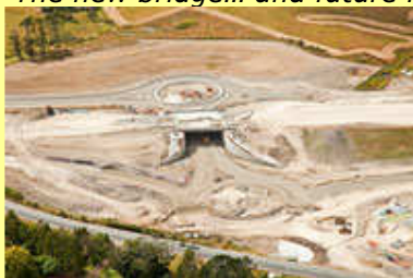
Interchange under construction