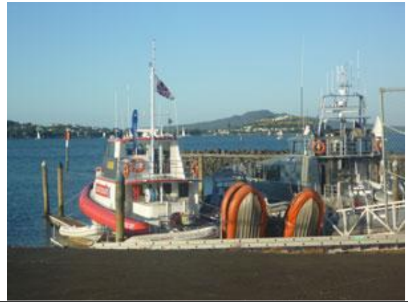
Other vehicles at the Base

This helicopter usually spends around 3 to 4 hours in the air in every 8 hour shift, although some days it can be up to 6 hours in an emergency. Police dogs also get the occasional perk of travelling in this helicopter (and are usually better behaved than their handlers).