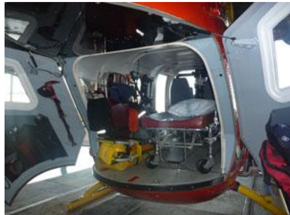
Inside the helicopter