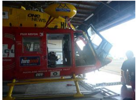
Room for the crew