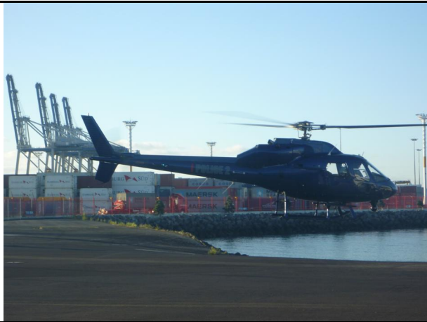
Police helicopter returning for our visit