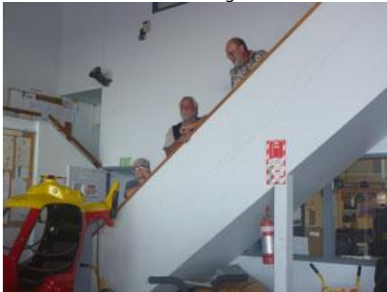
Watching from above