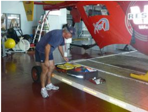
The small life saving medical kit

The paramedic showed us his emergency kit. It isn't super huge due to weight – first the helicopter has limits and sometimes they have to carry it up and down hills– but it contains enough items to be effective. All drugs are the same as the ones carried in ambulances to allow for seamless transfer between the two services.