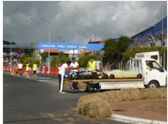
A few of our many helpers hard at work