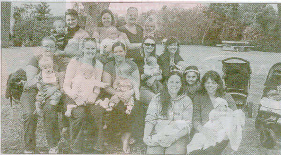
Team effort: They reckon it's something in the water. These Massey High School teachers have all had their babies over the past 18 months and all but three of the new arrivals are girls. Maths, science, and English departments are all represented.

But what you may not have noticed was the photo next to it (I only saw it as I went to scan the above). My daughter and grandson are on the far left: