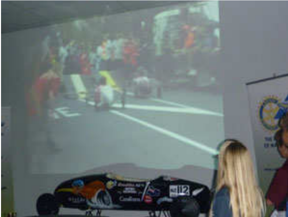
The winners of the Technology prize, Waitakere Primary, watching their 5 minute video on the wall