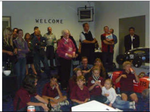
A few of the kids, parents, teachers, supporters and Rotarians watching the big screen