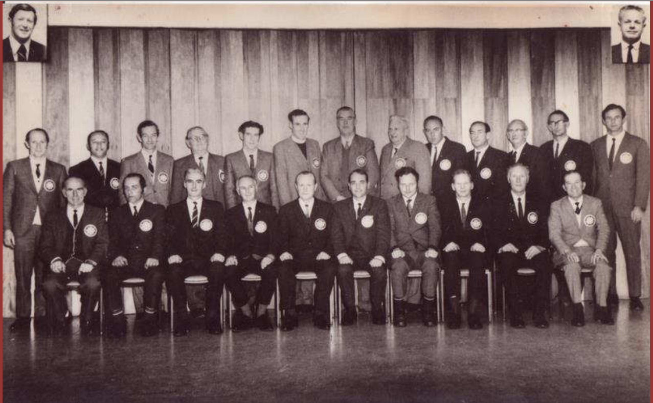
1970: The Founding Members