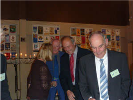
Members, past members, friends from both our Club and the Rotary world, Rotary banners, photos, memorabilia, flowers, balloons, videos... all turned it into a very festive occasion