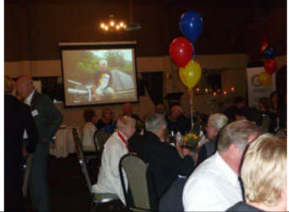
Attendees deep in conversation with the video playing in the background