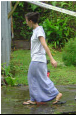
Bucketing water on the island