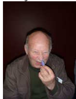
Some not so serious creativity