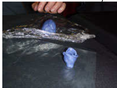
A completed flower