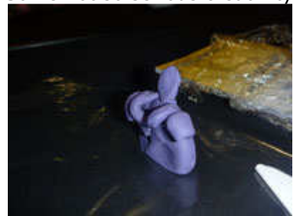
A completed non flower