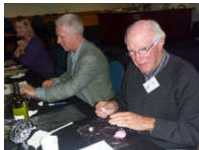
Some serious creativity