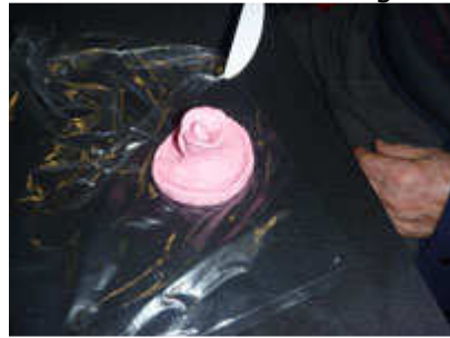
Jack's flower with buit in vase