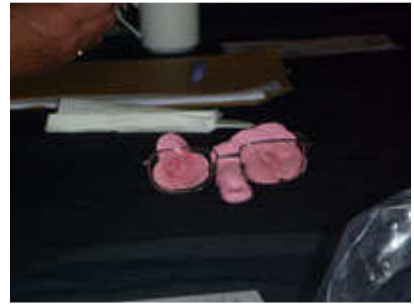
Flower eyes... with a nose