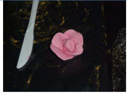
A finished flower