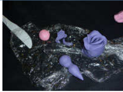
Flowers in the making