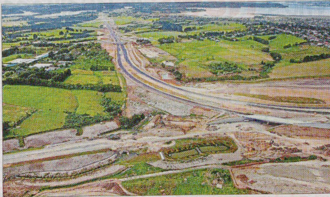
September completion: Looking east along SH18 Hobsonville deviation from the SH16/SH18 flyover. Plans for the opening are in the early stages but could include another bike/walk day before the traffic starts.

Mr Parker says access will also be improved to the