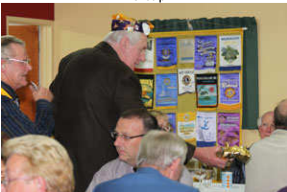
Lions and Rotarians all contributing to the cause