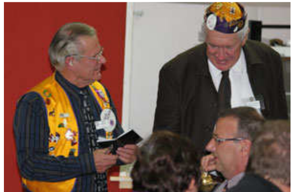
The “Tail Twister” busy extracting cash out of the unwary as fines