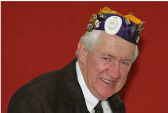
Their Squire – with many Lion badges decorating his cap