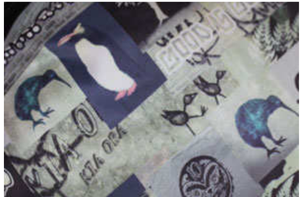
Terry's waistcoat, complete with penguin. Now we know where Happy Feet got to.