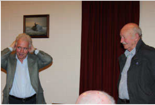
Heads or Tails?