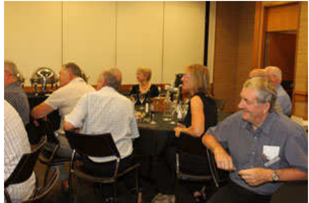
Rotarians from the two Clubs