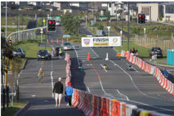
Our three cars at the finish