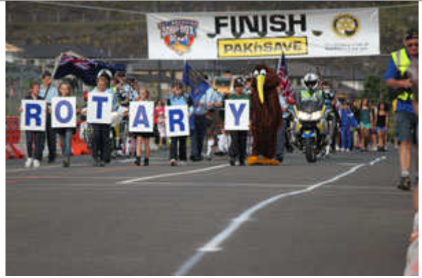
The Parade starts