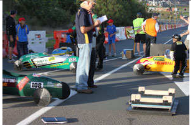
Our three West Auckland cars ready for their practice run