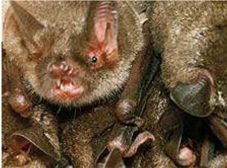
Short-tailed bat cluster, (close up of head)

New Zealand has two, formerly three, types of bats: