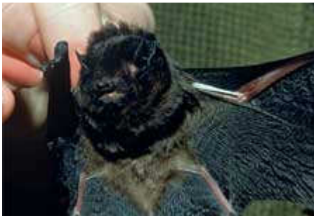
Long-tailed bat , (hand held showing detail of head and wing)

The endangered lesser short-tailed bat is an ancient species unique to New Zealand and is found only in a few locations.