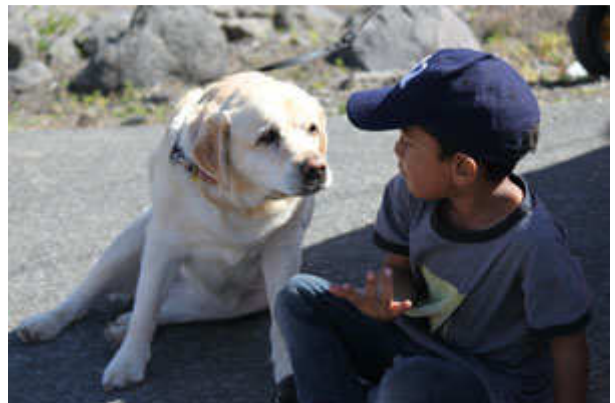
Rotadog Caza with a new friend (And no, he didn't share his food with her!)