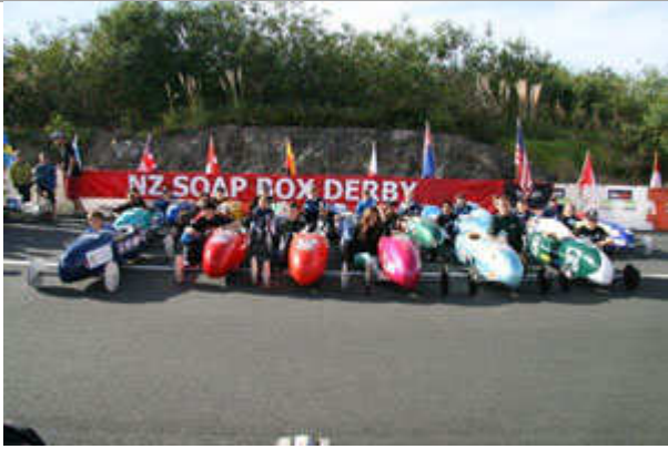
Twenty four cars lined up for the official photo prior to the parade