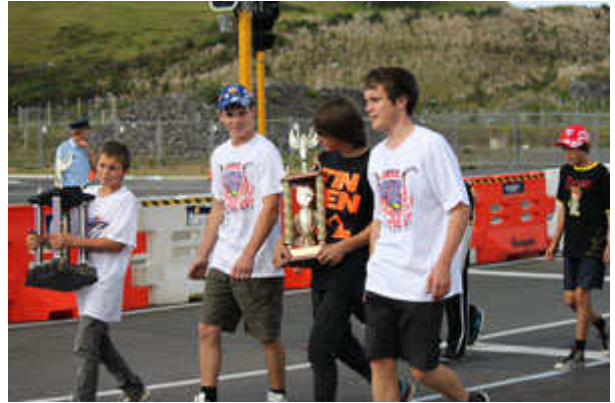
The Masters cars boys