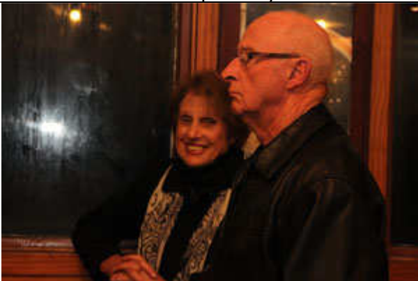
Meet the Hodge parents