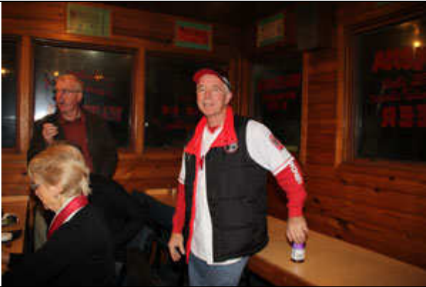
Our American friend dressed in an American version of the West