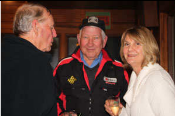
Mike: Car racing is definitely a Westie thing