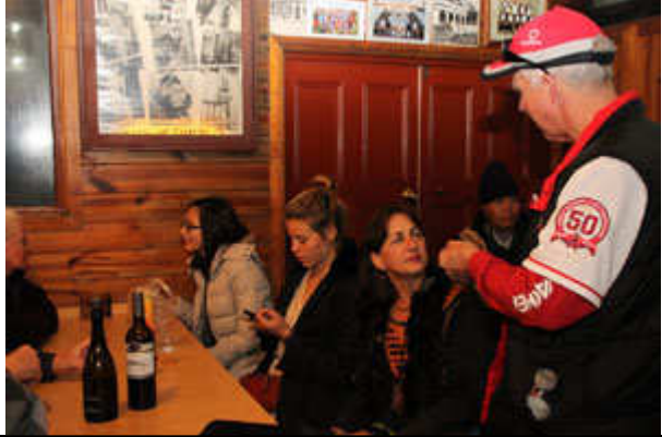
Westwind Theatre dining room