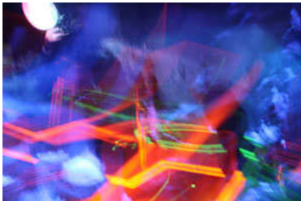
Black light photo when you forget to turn on the flash.