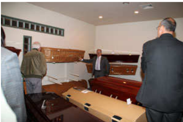
After assessing the options (and prices) most of us seemed to prefer the cardboard option