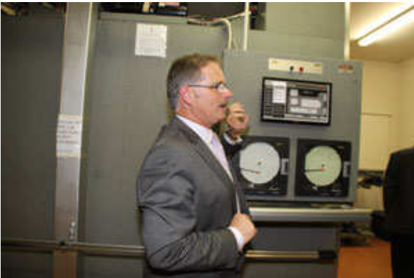
State of the art crematorium installed a year ago. Run by computer it can be controlled from the room – or from elsewhere in the world