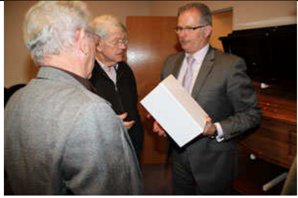
The letterbox version