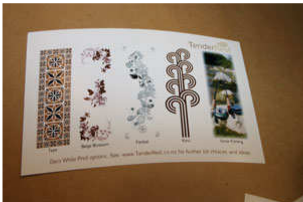
Decals. They seem to be missing the “Rotary Wheel” option. But never fear, we have spare SBD Rotary stickers that can be used instead – or as well as the “Gone Fishing” ones.