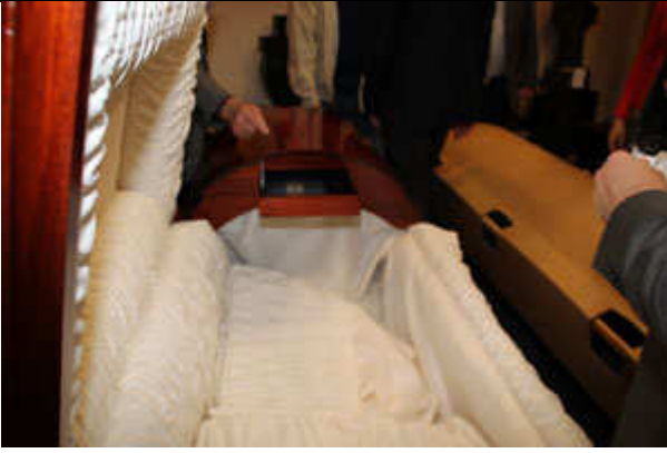
The price of a small car – with built in glove box. Amazingly enough some of this quality and price have been through the crematorium