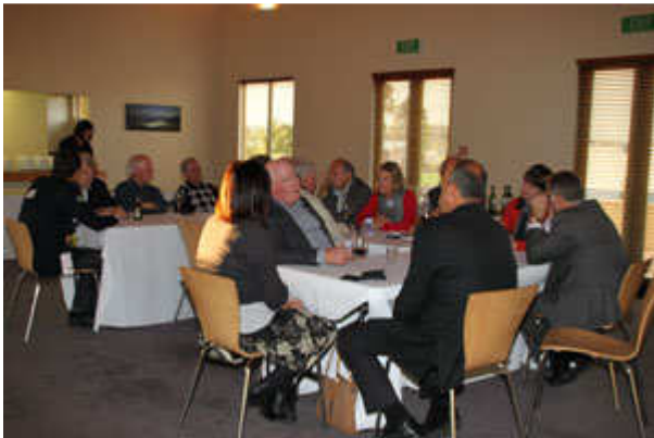
Our Rotarians deep in discussion over dinner

Our meal and the video were followed by a tour of the building – very interesting and informative.