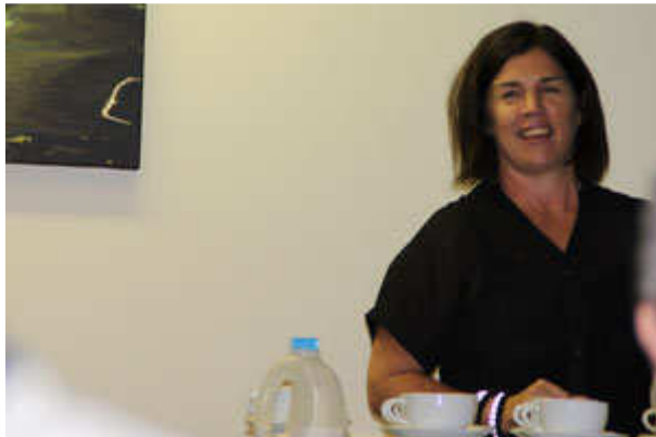
Our chef for the evening. Her company caters for groups, work functions to parties all around Auckland – and do a superb job.