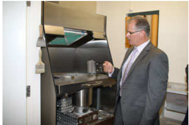
The final step before placing the ashes in a suitable container