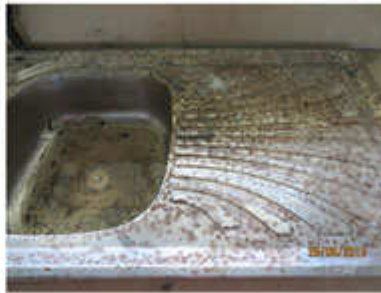
The 'new sink' after the plasterer had been through ....