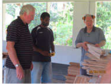
And the dining room turned into a joinery workshop....