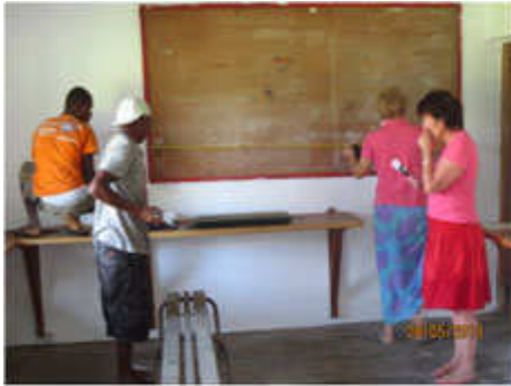
The new 'Science Room' ....