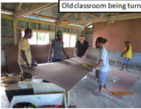
Old classroom being turned into a new Girls' Dormitory ....