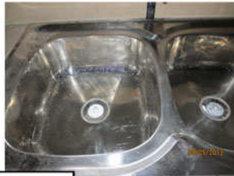
Kitchen – ready to use ...