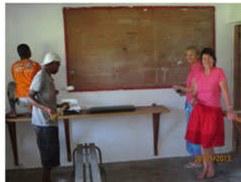
Freshly painted and with new benches all around the walls.