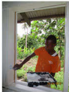
Painters getting the windows ready for the insect screens ...