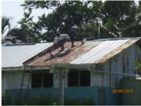
And re-roofed, so the water can be collected in the tank we installed last year...