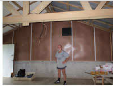
Girls' Dorm almost complete ...