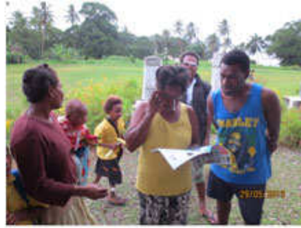
7 am in the village .... 287 pairs of glasses ... all gone in under an hour!