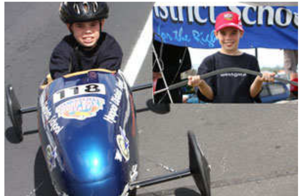
Waitakere Race 2009 The major crash – and car out of the race (As seen in the Western Leader)

Keep an eye on the car as it goes down the track. If it wiggles then there is a steering problem that will rapidly get worse. Actively encourage your drivers to report problems. If they say "It felt funny" or "I hit a hay bale" - pay attention! The next race may result in a crash and disqualification.