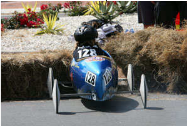
Waitakere Race 2009 A hay bale incident prior to a major crash in the next race