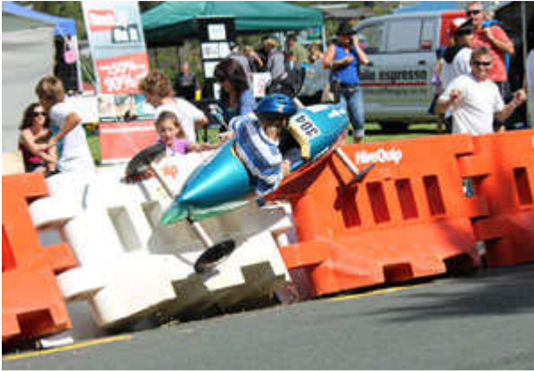
Whangaparaoa Race 2011 (As seen on the front page of The Rodney Times)

Loose Steering and poor brakes make great photos: