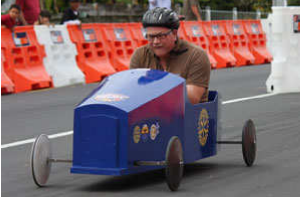
A North Shore Teacher in the Rotary car