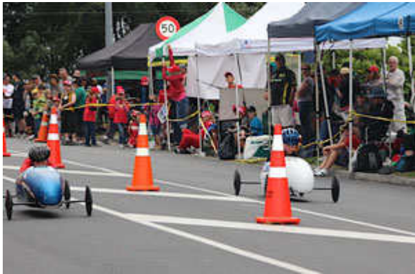
The pit crew area at the start