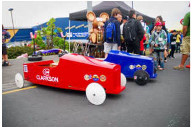
Adults versus the kids – the "Corporate" cars