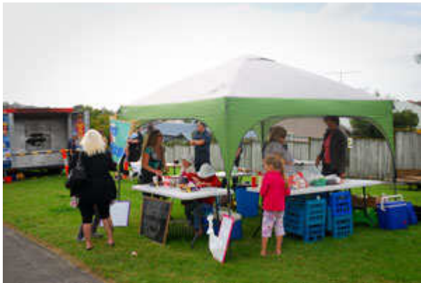
School Stalls feeding all the people. All profit went to those who ran the stalls