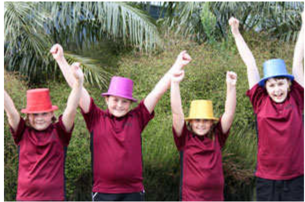
Waitakere Primary Cheerleaders <where on earth did they find those hats?>