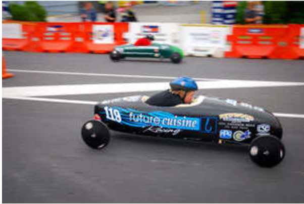
Swanson Primary in the Future Cuisine car