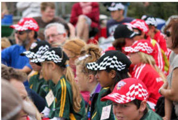
Everyone keen to hear the results