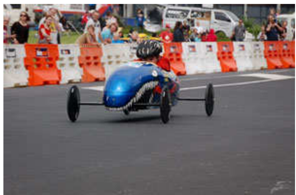
Henderson Intermediate in the Douglas Pharmaceuticals "Hairy Lemon" The Hon John Key also contributed $300 to our event from his charitable fund