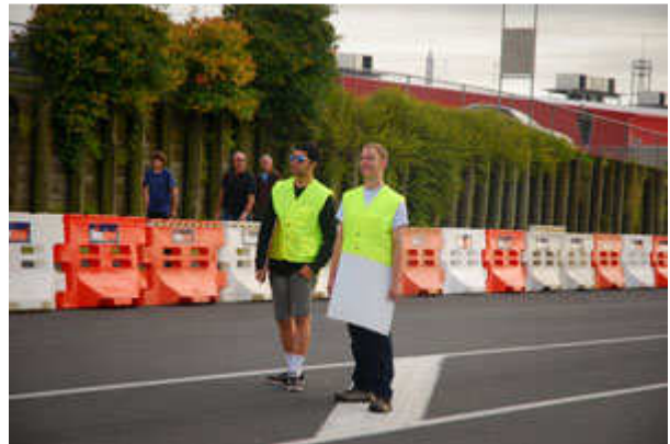
“Brake Now” signs ready to be raised at the finish