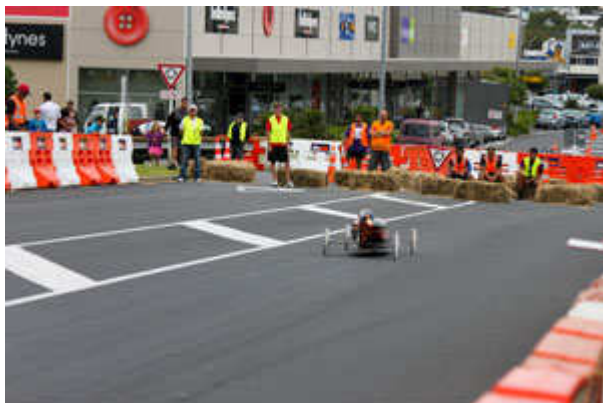
Heading safely to the hay bales