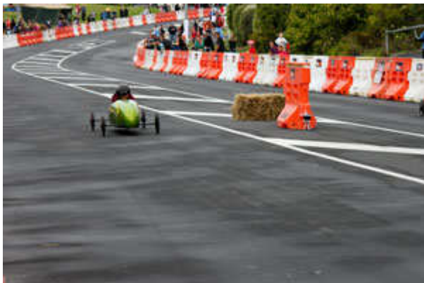
Waitakere Primary’s “Green Machine”