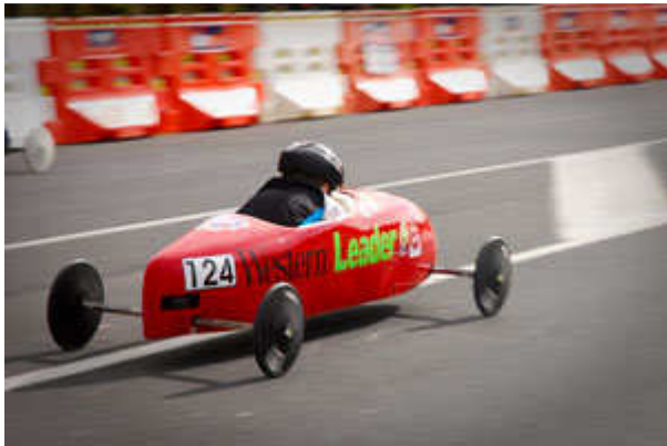
Hobsonville in the fast Western Leader car