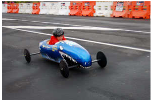
Henderson Intermediate and The "Hairy Lemon"