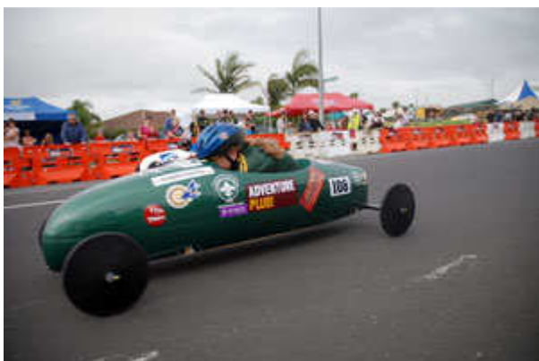
Riverhead Scouts in their Harkins House Haulage / North Auckland caravans car

<instead of manning a speed camera to catch everyone and fine them>