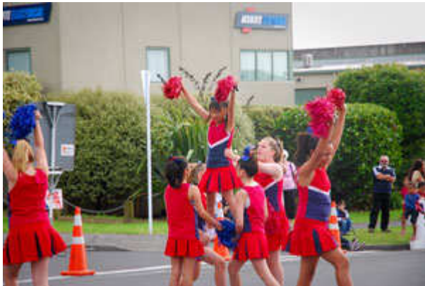
Henderson Intermediate Cheerleaders