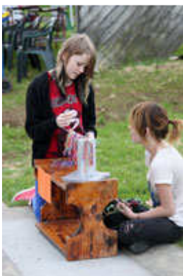
A stall for fundraising

<Happy the race is over? Or loving every minute of it?>