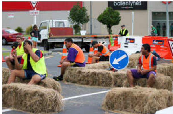
A break between loading the car return truck