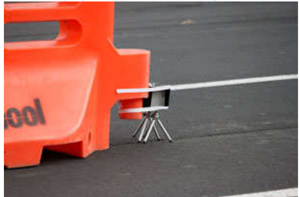
During track calibration the timing reflectors blew over. A spot of tape and it was secured for the day.