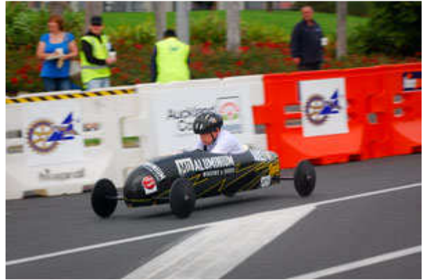
Massey High representing MD Aluminium