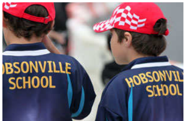
Teams were out in school colours