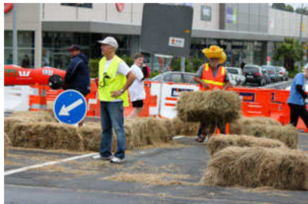
The team keeping the hay bales straight