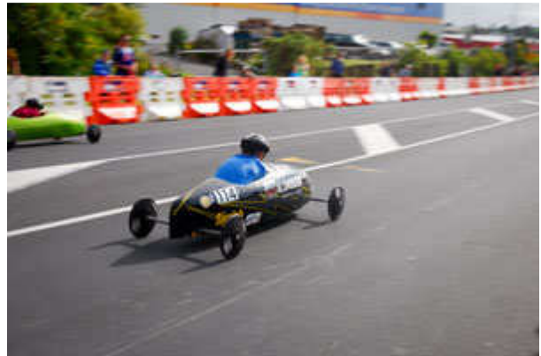
The “Green Machine” and Massey High off to a racing start