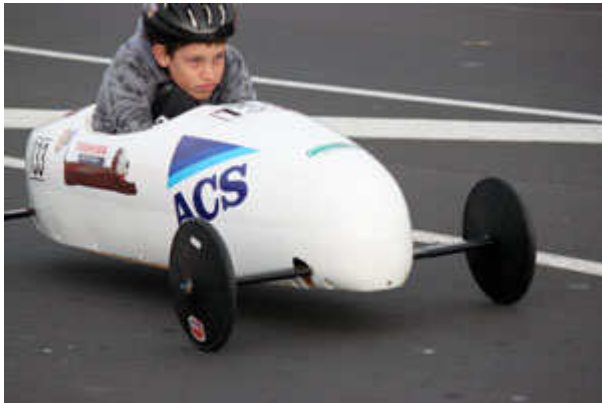
Rutherford driver concentrating on the finish