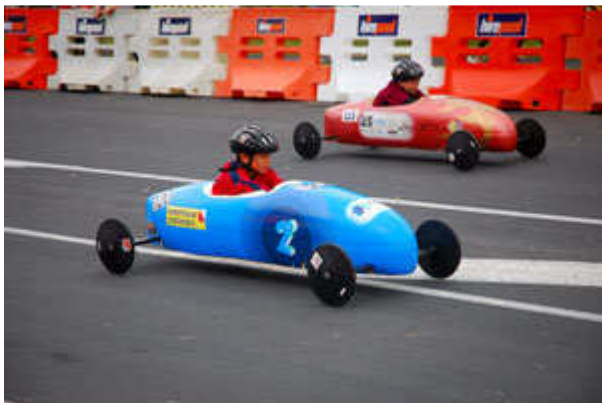
AGC Sunderland against Waitakere Primary

Sponsors are: Distinction Furniture St Michel Vivid Computers Waitakere Architects