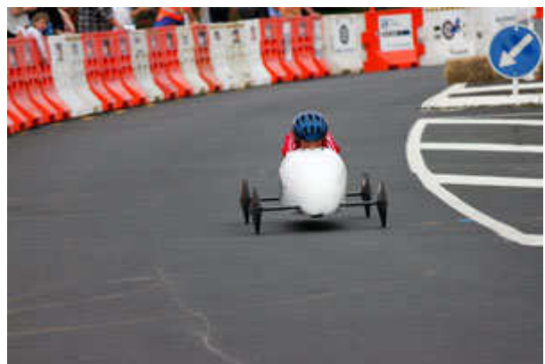
The "Unmarked" <from the front> Police car

<Happy the race is over? Or loving every minute of it?>