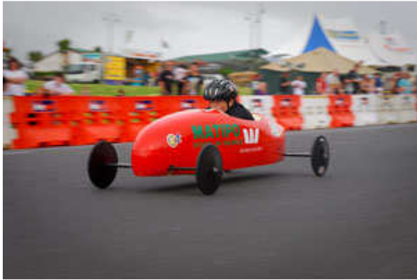
Our new school Matipo in the Westpac car