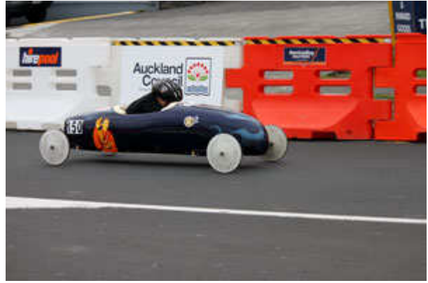
Bruce McLaren Intermediate

Sponsors are: Distinction Furniture St Michel Vivid Computers Waitakere Architects