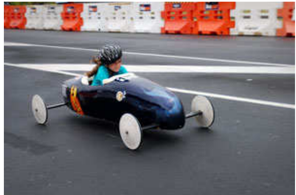
Bruce McLaren driver