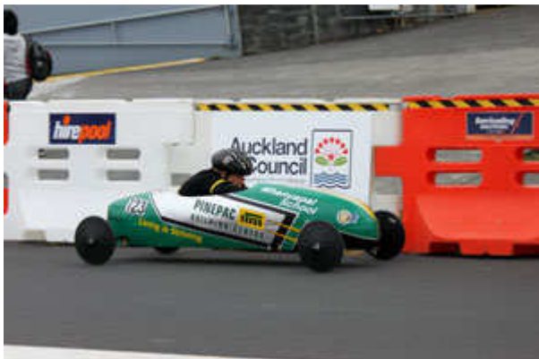
Whenuapai school in the Pinepac racing car