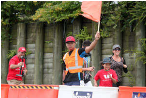
No racing whilst the red flag is up

The Fire Service came with their kitchen fire display