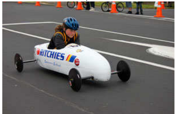
Swanson Primary In the Ritchies car

<Notice how the colour scheme bears a striking resemblance to the Pinepac ITM V8 race car?>