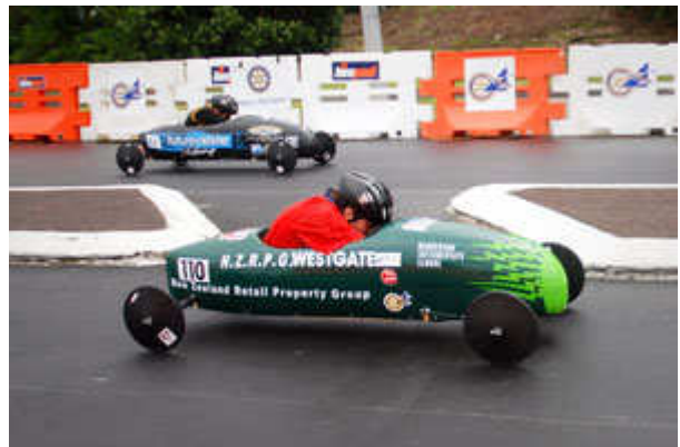
Henderson Intermediate Representing NZRPG <Westgate shops management>