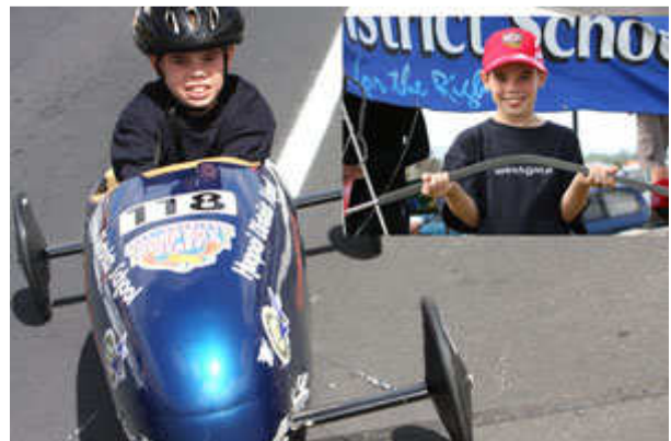
Waitakere Race 2009 The major crash – and car out of the race (As seen in the Western Leader)

Keep an eye on the car as it goes down the track. If it wiggles then there is a steering problem that will rapidly get worse. Actively encourage your drivers to report problems. If they say "It felt funny" or "I hit a hay bale" - pay attention! The next race may result in a crash and disqualification.