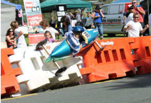
Whangaparaoa Race 2011 (As seen on the front page of The Rodney Times)

Loose Steering and poor brakes make great photos: