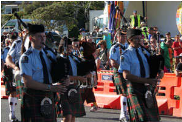
The police band