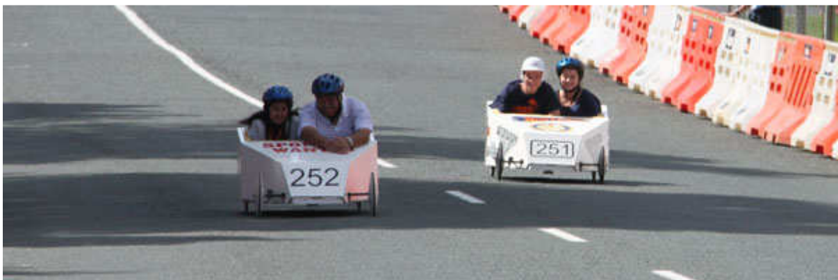
The Super Kids cars drew a lot of interest this year from a few adults as well as our special needs children.