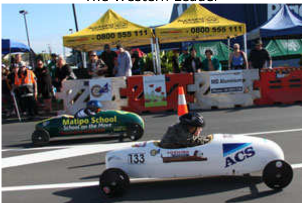
Matipo School with West City Holden sponsorship racing Rutherford High