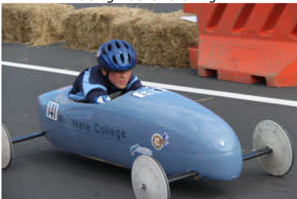
Waitakere College rejoined us