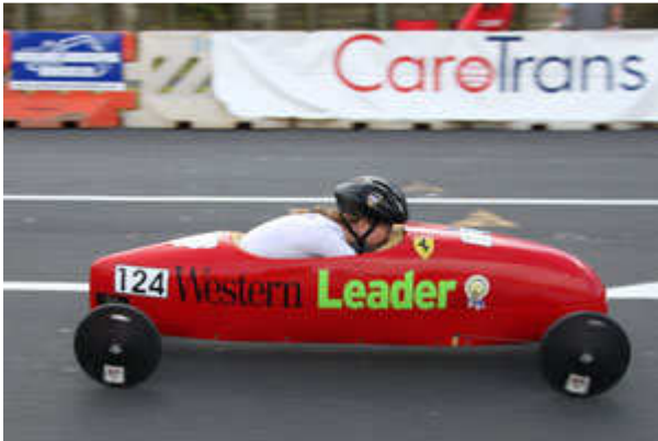
The Western Leader