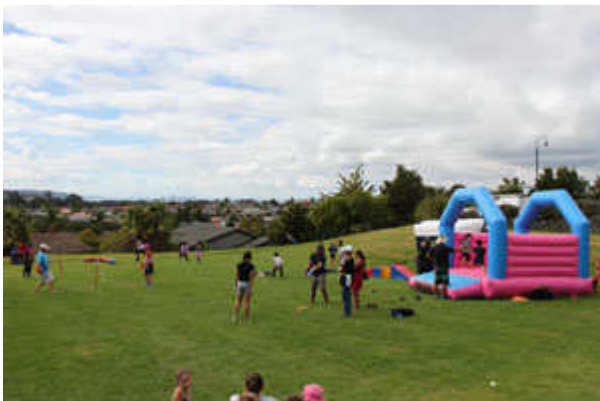
In2it Street games provided various activities for extra family fun time