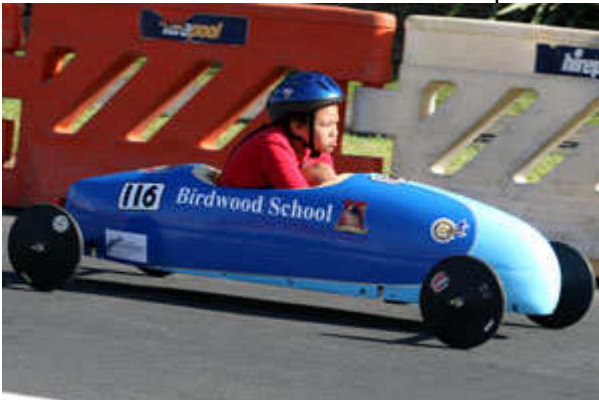
Birdwood School joined us again this year