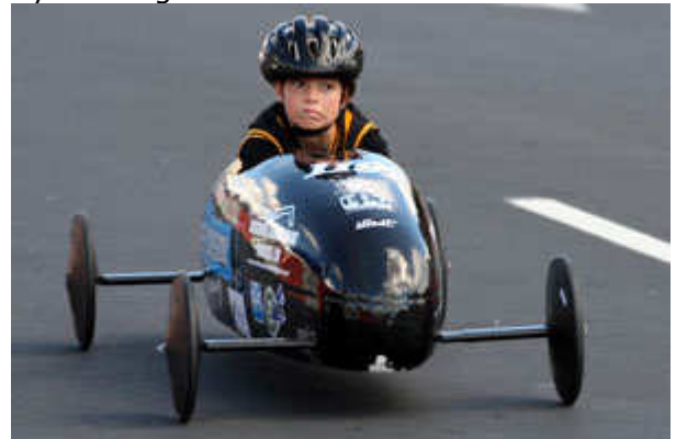
Interesting expression from a Swanson School driver!