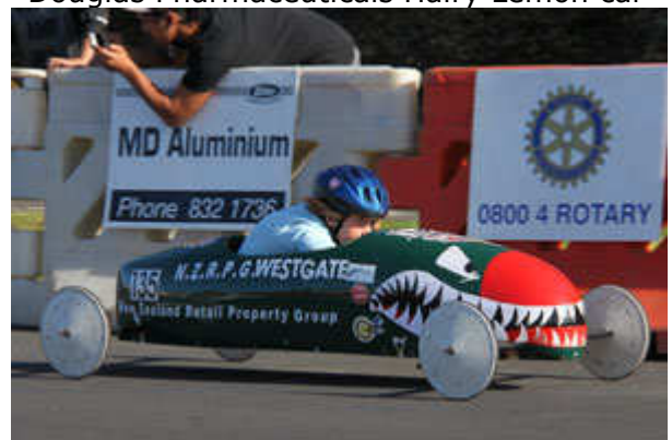
NZRPNG were great sponsors with the extra of a shopper's prize