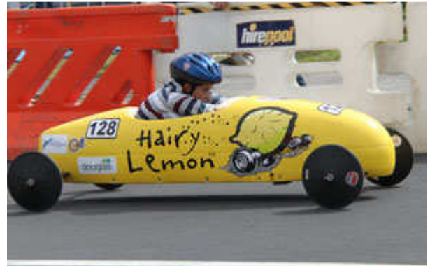
Douglas Pharmaceuticals Hairy Lemon car