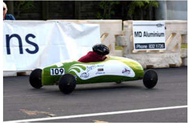
The Waitakere car with many sponsors