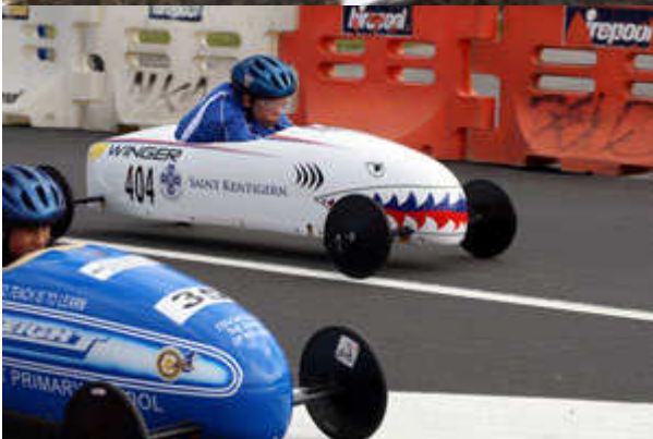
Bairds Mainfreight and St Kentigern College

Mainfreight (trading as Carotrans in the States) have been long term supporters of all the derbies with very low cost shipping of both the winning car to Akron, Ohio and the freight of parts back to New Zealand.