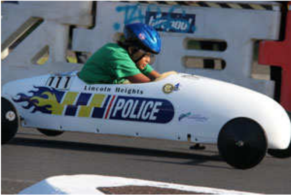
Where would we be without the Police presence?