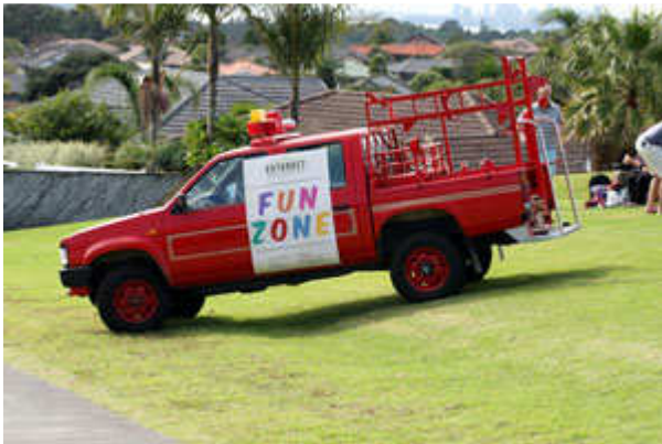
Thanks to the West Auckland Rotaract group for their help with running the event and their "Fun Zone"