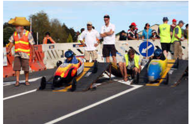
St Kentigern and Parnell School