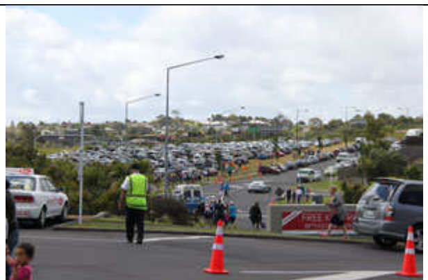
The grass parking area – as seen at the Henderson Rotary Santa Parade in Dec 2014