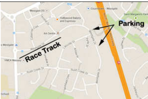
Parking map Please leave it clean and tidy

The smaller the impact we make on them and their businesses the better!