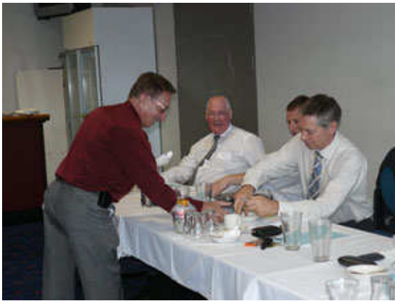
So his guest gets to pay too