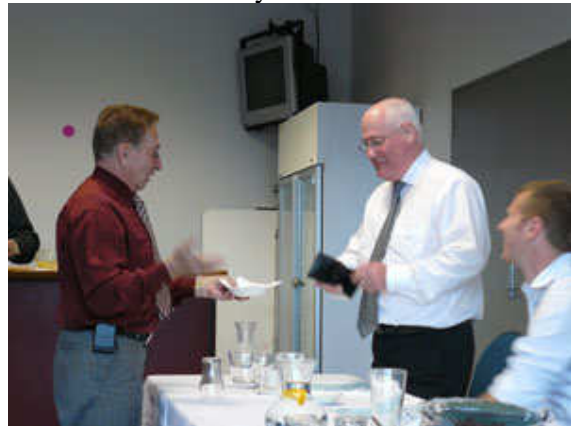
But even so he got it wrong...