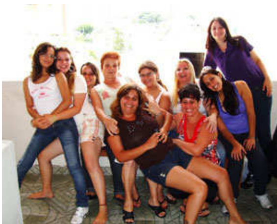
BBQ at Grandma's house with all the women from the family and 2 friends

Photos from Beatriz – our International student now back in Brazil.