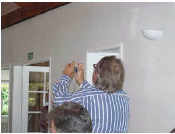
West Harbour Bulletin Editor at work