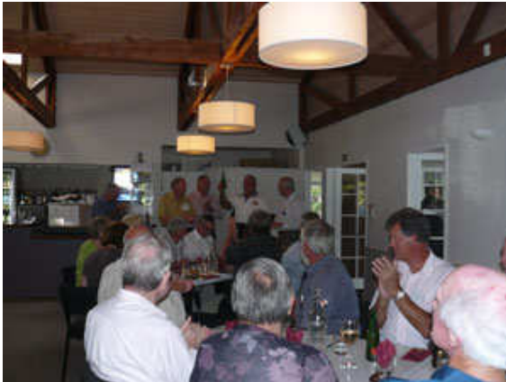
Some of the interior diners (recognize anyone?)