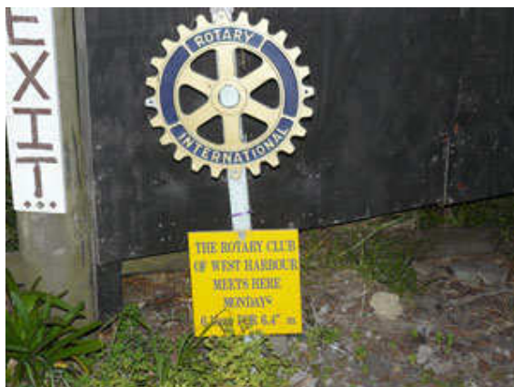
This sign was in hiding inside the gate

We joined with West Harbour, Kumeu, New Lynn and Henderson for a BBQ at The Brigham in Hobsonville on Monday. It was a great evening with somewhere in the region of 110 people to talk to.