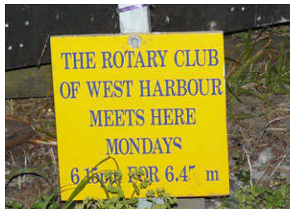
But it is still reasonably clear