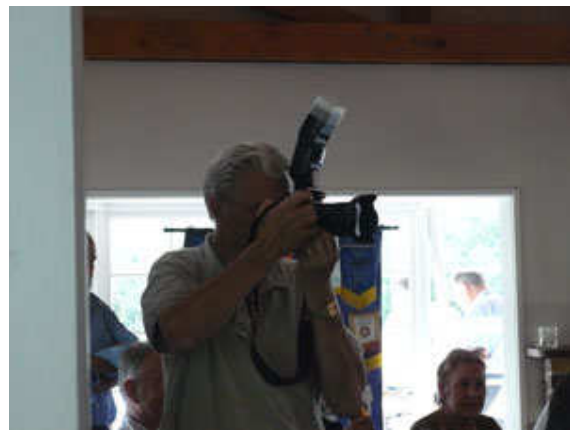
And so was the Henderson photographer