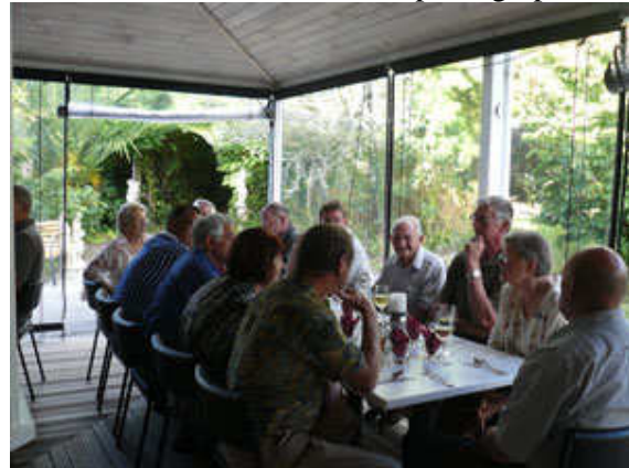
And a lot more people dining out on the deck