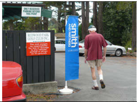
A couple of our sponsors – Broadlands Finance & Smith and Partners