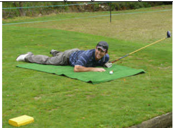
Golfing from your knees isn't the easiest task in the world - ask the Sunderland team. A fair number of the balls ended up in the creek behind but all the ducks survived.... just.