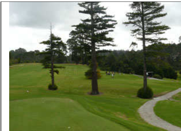
Golfers widely scattered over the rolling grounds