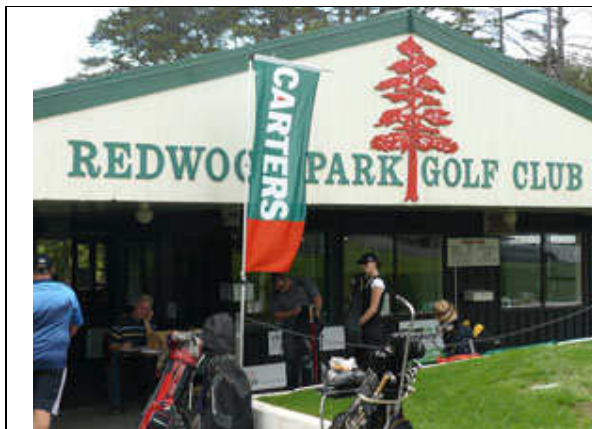
An excellent venue

In the meantime, photos of the day follow: