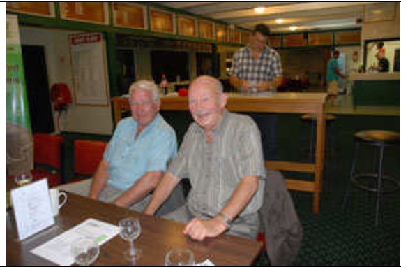
The Golf Club humming at dinner time