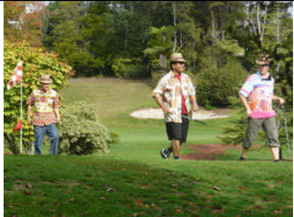
The Web Co team at work