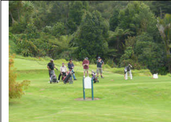
Golfers ready to tee off