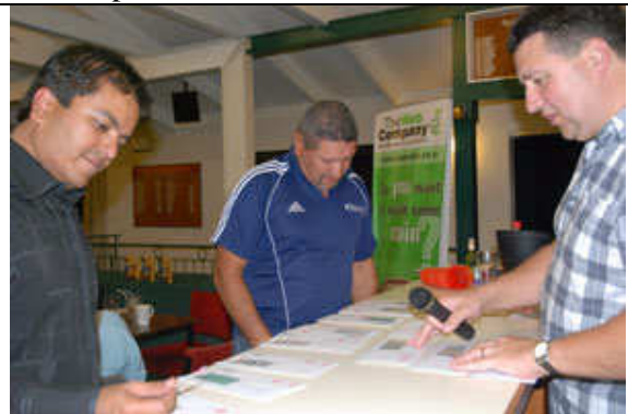
The Serious Business of choosing a prize