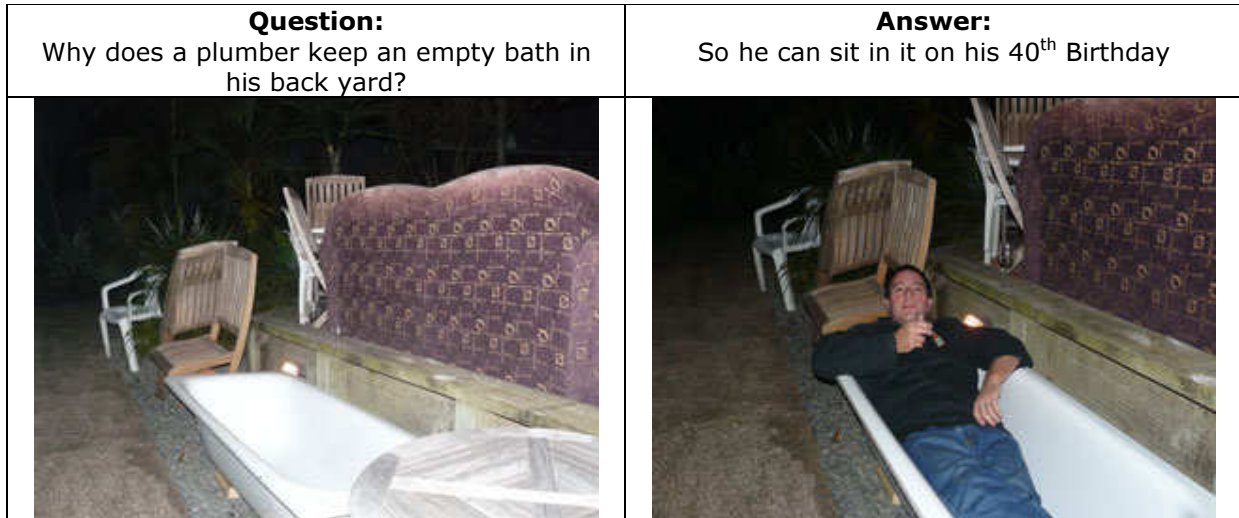
Happy Birthday Ross