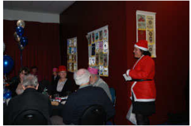
No Christmas Party, even a late mid winter one, is complete without Santa armed with pieces of coal and a riding crop for those who have been naughty