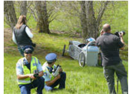
The Police Car named "Smashed" made a minor detour past the radar guys & police photographers- instead of aiming for the end of the track