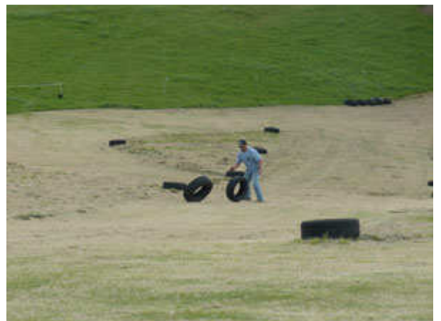
The boys enjoyed getting the barrier tyres down the hill. Tyres bouncing in all directions...