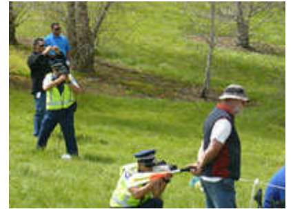
Radar guns, cameras and timing

Oh, and how to test the sound equipment – have a policeman do it: “You boys at the bottom of the track, if you can hear me put your hands up.... This is the Police! Put your hands behind your head and lie face down on the ground”