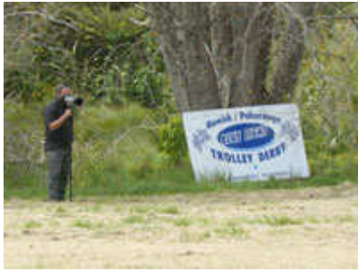
A police photographer by their sign