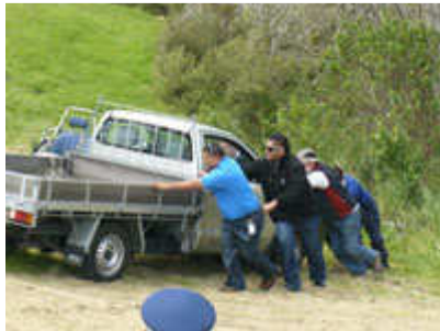
The return vehicle – the only car that got stuck