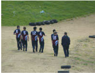
One team checking out the track on foot