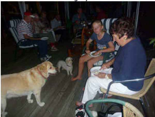
The dogs kept an eye out for stray food