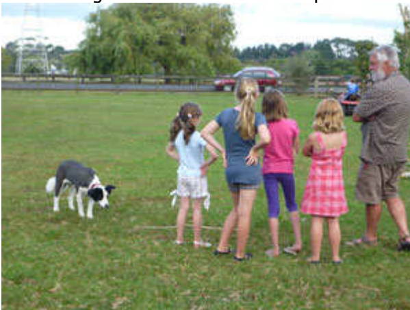
Tess more interested in getting someone to throw a stick than watching the fun