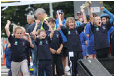
Ready at the start