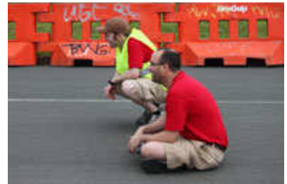
The GSE team from Texas helping out at the bottom – along with a few Rotarians and Rotaract people