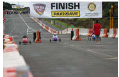
The Track – 3 lanes, straight with a dip before the finish