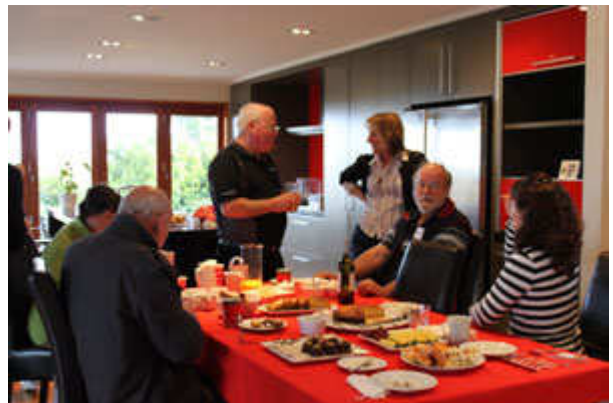
Rotarians crowded round the food