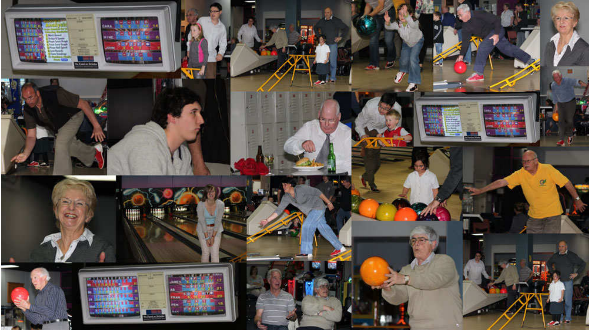
The Waitakere Rotary Family having a night out 10 pin bowling