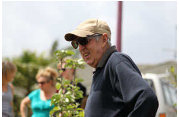
Locals pleased with the results of the hard work