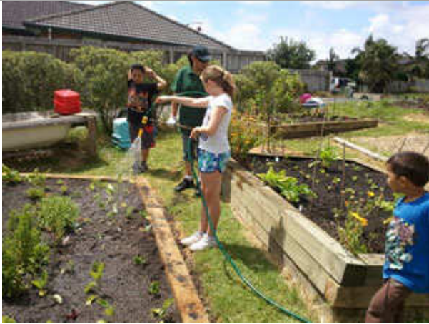
A hose borrowed from the neighbours to water the plants in