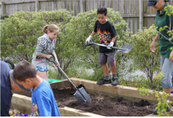
The local kids helping out