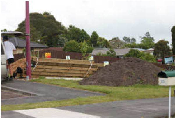
The timber was bought by Waitakere Rotary.