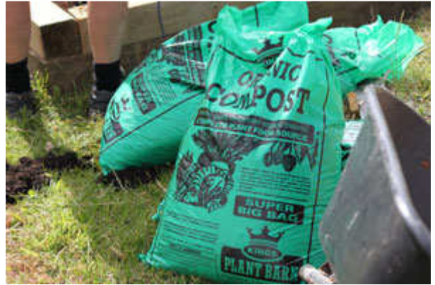
Multiple bags of donated compost from Kings Plant Barn. 3 bags went into each garden before the top soil was wheel- barrowed in.