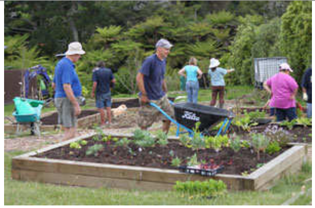
The gardens taking shape