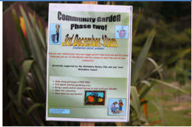
Jadewynn Drive Community Garden Started on the 9 th April 2011 at the 9910 District Conference Community / Waitakere Rotary Working Bee 3 rd December 2011