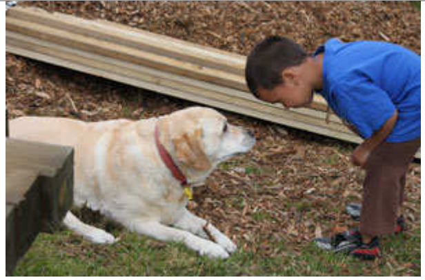
Our "Rotadog" Caza with another new friend. As usual she got a lot of cuddles.