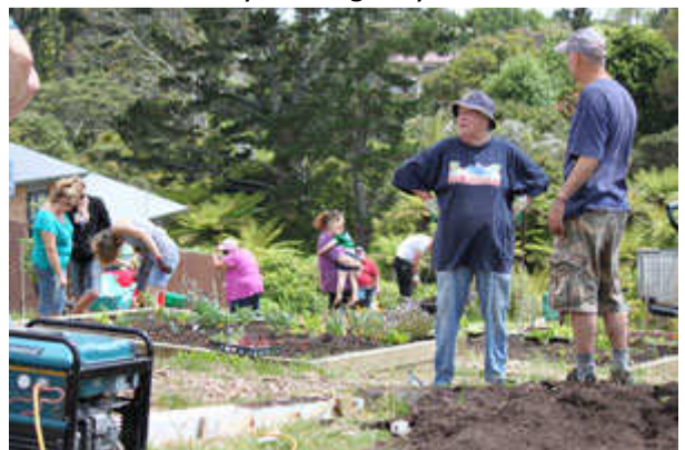
The locals from the community at work