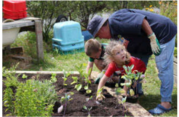
Adults and children at work planting out the seedlings