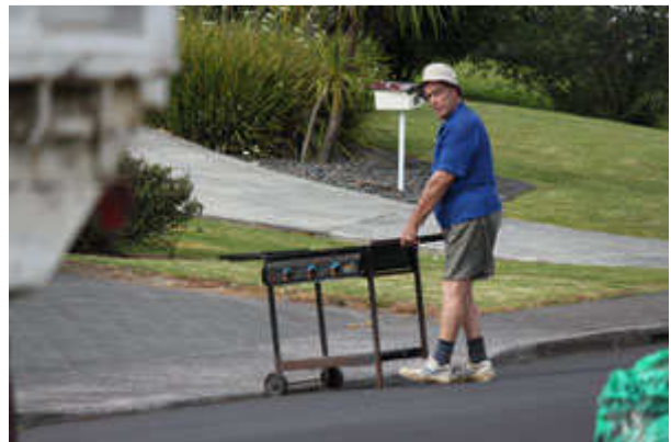
A neighbour bringing over an essential tool – his BBQ