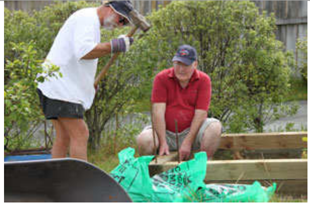
The timber is held together with metal rods inserted through drilled holes in the timber.