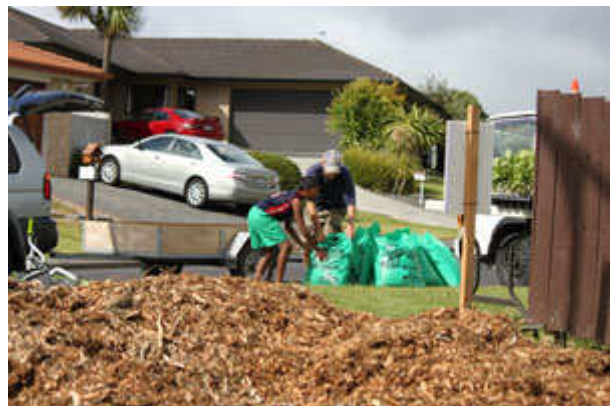
A large pile of wood chips ready to go on the paths and a few of the many bags of donated compost being unloaded