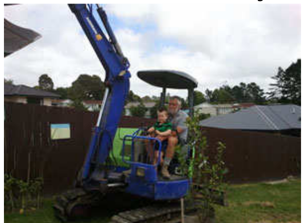
Boys being boys...