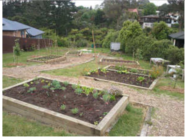
Six new garden beds installed

Thanks to Linda and Phyllis for sending through some photos – it helped make the record complete.