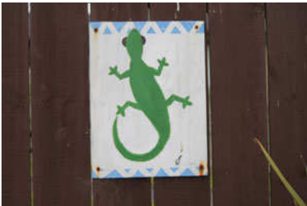
A few paintings decorate the fence