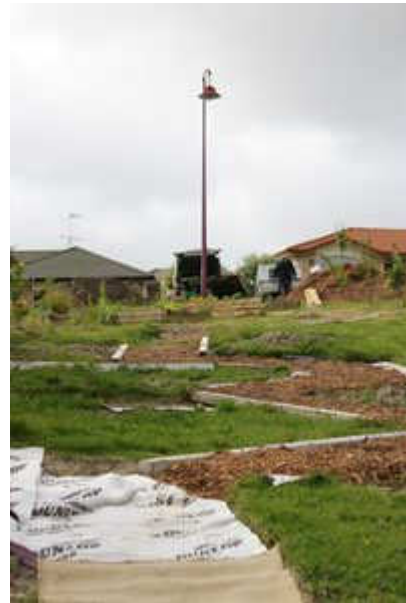
The garden from below.