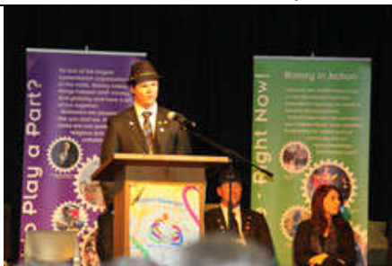
GSE Team back from Iowa