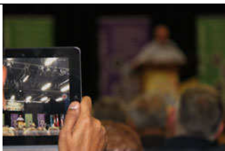
Left: Using a laptop as a camera... interesting...