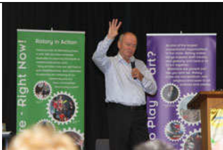
Keynote Speaker Sir Graham Henry