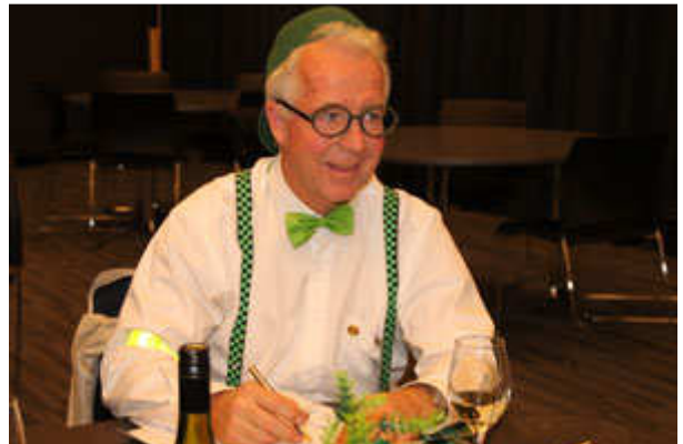
Craiger - International