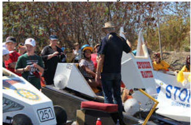
The bonnet lifts up to allow very easy access for the less agile