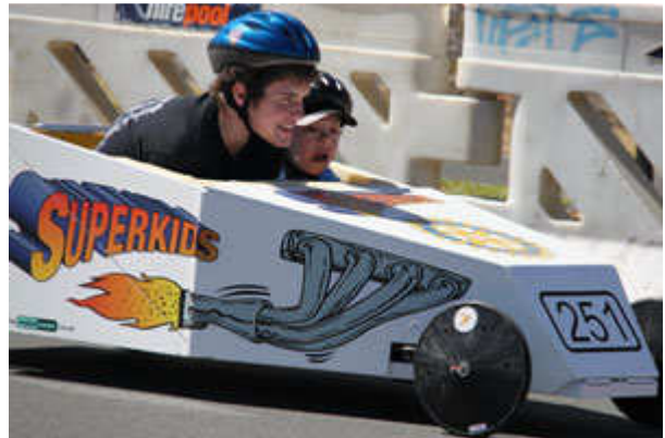
Our new "Super Kids" cars for a driver plus special needs passenger