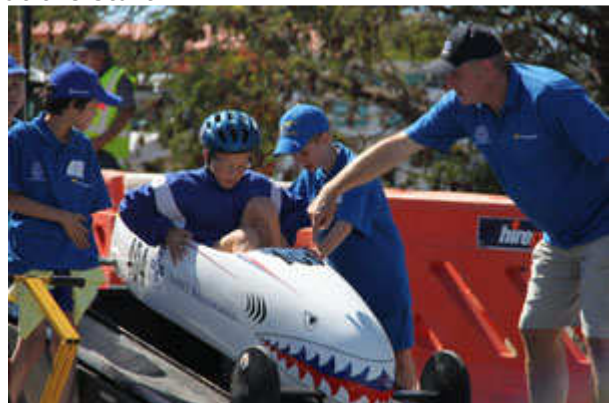
A couple of the teams at the start. High enthusiasm from all involved