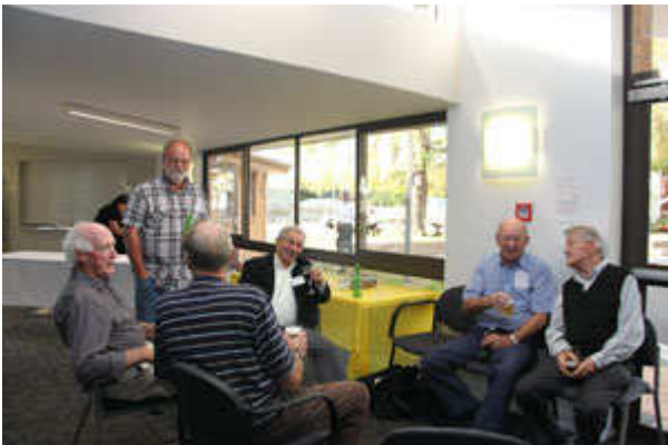
Our early arrivals pre dinner drinks. Ever heard of socializing with the other Clubs?