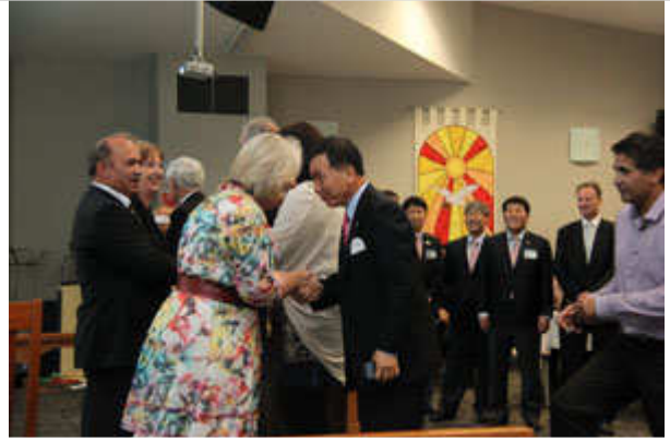
Handshakes and hongis