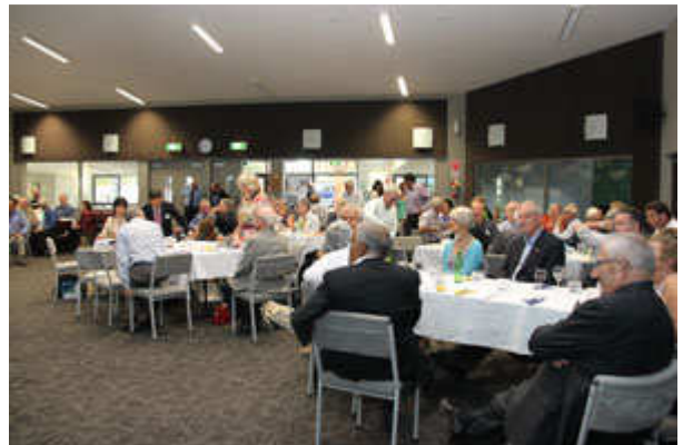
A very spacious room with some of the tables shown