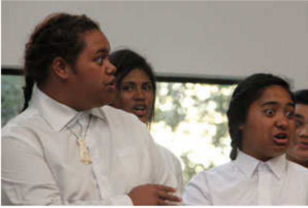
The local school assisted with their choir. Multi-talented students. They also waited on tables (Their school raced at Northcote last year in the soapbox derby)